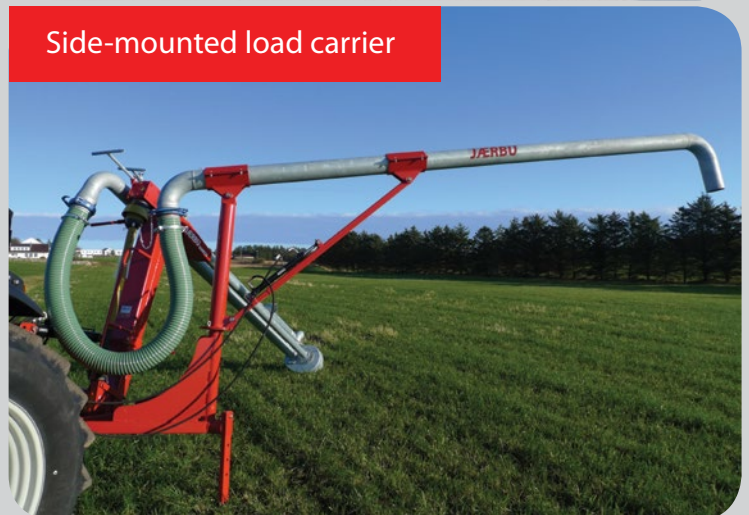
Side-mounted load carrier